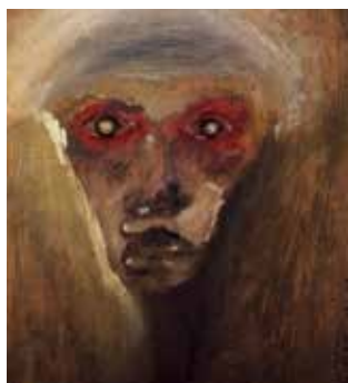
"Red Gaze" Arnold Schoenberg, 1910