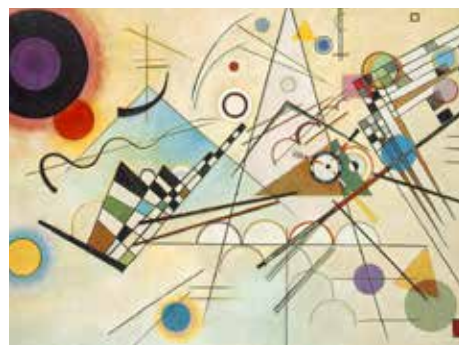
"Composition VIII" Wassily Kandinsky, 1923

'Complete Artist' – a 21st century artist for 21st century audiences