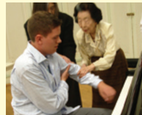
Students were changed after she taught how to use arm effectively.

Her technique was well received by participants and they were remarkably changed after she taught. Professors of academy also came on to the stage to make demonstration performance.