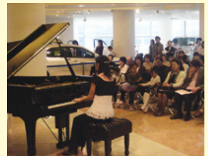
Toyota automobile showroom in Tokyo is always filled with customers. Once music starts, they began to see the pianists instead of automobiles.