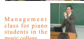
Management class for piano students in the music college.