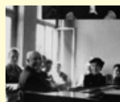
With Prof. Giesecking.