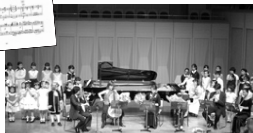
22 piano teachers, 2 composers, 6 string&woodwind players, local branch of PTNA (Yamaha music shop) cooperate each other to organize this festival for young pianists