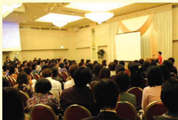
Over 120 of piano teachers gathered in Tokyo. They are the representatives of STEP station in their local areas, which are subsidiary organization of PTNA branch offices.

This year, the number of STEP participant exceeds 100,000 in total since 1997. And the number of station grew remarkably recently, that is, over 30 new stations established every year since 2003. And the average of participants per one venue is 92 people which grew by 35% as compared to 67 in 1997.