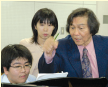
Each lesson was a process of understanding students' talent, musicality and personality.