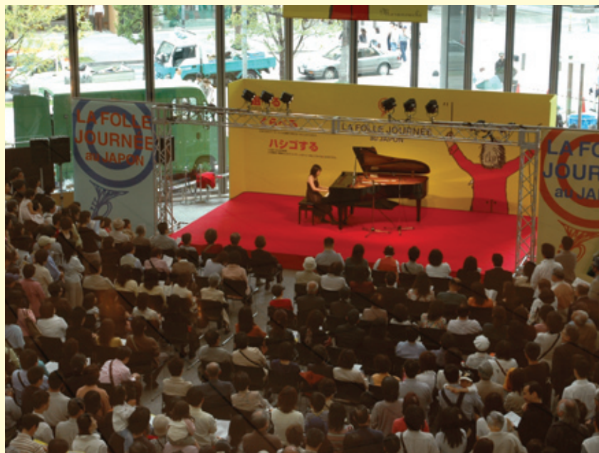
Hundreds of audience and passersby listened to the piano at the lobby of Marunouchi Building, one of the commercial and entertainment centers of Tokyo.

The 1st week of May, music festival "La Folle Journee" was imported in Japan from France and over 1,000 musicians from France and Japan played all Beethoven programs in 3 serial days. The Marunouchi area- the economy and financial center of Tokyo, was re-designed like Beethoven village. The primal events were held in Tokyo International Forum building which has four big halls, and some neighboring buildings were used for related events. Amateur pianists of PTNA piano competition prize winners played piano in the main lobby of Marunouchi building just across the Tokyo station. Their piano were sounded beautifully in stairwell, and lots of passersby stopped and