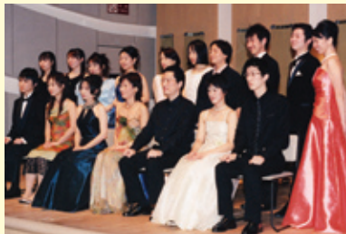
On February 26th, Winners concert of 28th PTNA grandmuse division was held in Tokyo, Hakuju Hall.

Amateur is not professional, but could reach quite high level. High motivation, friendly rivalry, and joy of music---their spirits are as same as professional musicians.