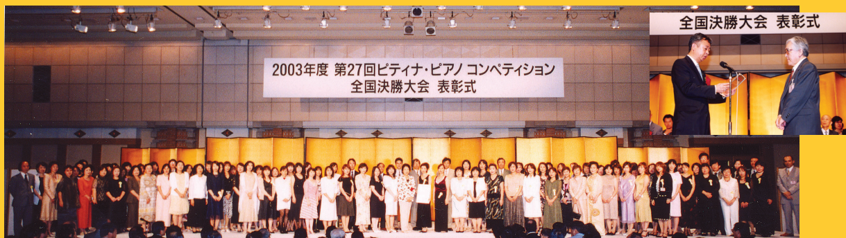
266 teachers were awarded as "Excellence Prize for teachers". And two teachers were awarded for their 20 years of achievements (above).

It is also identical that the number of participants was sharply increased in suburban cities. This explains the standardization and the qualitative development of piano education throughout Japan.