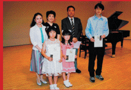
Participants and Advisors. Those participants were awarded for their continuous participation of STEP. (right) Over 180 people participated at two-days STEP session.