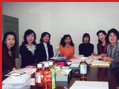
Staff of "STEP Station" are local teachers.