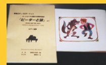
Station staff preparing for the special presentation given at the intermission. (above)Hand-made script and arranged music score of "Peter and Wolf" by Prokofiev.