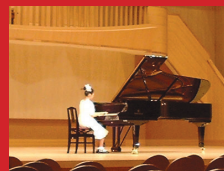
3. During the performances, jury members write brief comments and marks for each participants. After all the performances, marks are immediately calculated and results are announced in the end of the day.