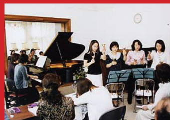
STEP can be arranged in various ways. (left) tea ceremony is held after the event. (right) Using Japanese traditional architecture as a hall.