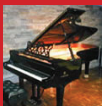
Participants can play piano with any other instruments, strings, wind instruments, voice, or even Japanese traditional instrument like Shamisen (left) was appeared. (center) Piano used by Richter, played in STEP.