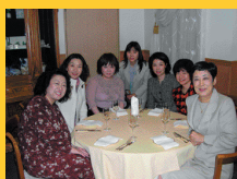
Teachers of PTNA-Nagoya branch.