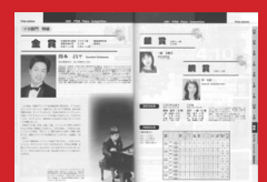
6. PTNA publishes a review booklet featuring the results, winners and participants name list, marks of final round, etc.