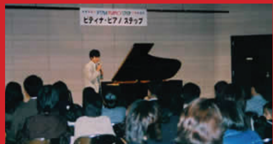
STEP is not only for participants, but also for teachers. They invite professors to give special lecture after the event.