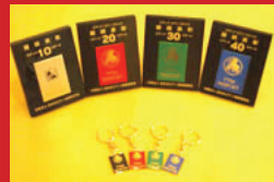
"To Continue" is one of the most important elements in STEP. Those who participated in 5 times or more, encouragement prize are awarded.