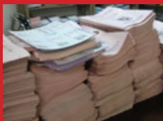
STEP leaflet and programs