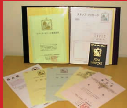
Advisors' comments, encouragement prize, etc.