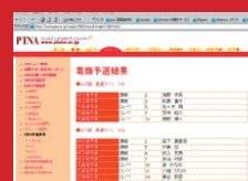
5. PTNA Head office announced the result on internet right after each regional round finishes.