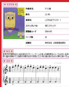
2300 mandatory pieces. Brief advise can be seen on the PTNA internet.