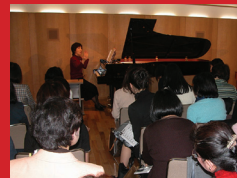
1. Seminars and master classes are held nationwide before the competition begins.